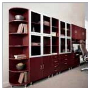
Modular storage components can be grouped together to create complete wall systems